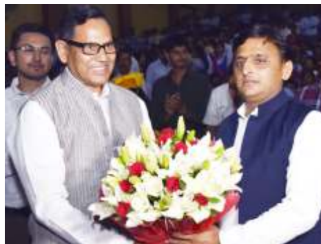
Shri Akhilesh Yadav, Hon'ble Chief Minister of UP