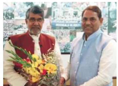
With Nobel Prize winner Mr. Kailash Satyarthi ji