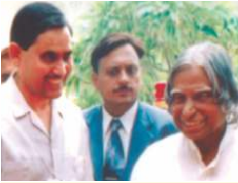
Dr. A.P.J. Abdul Kalam Hon'ble President of India