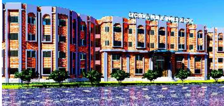
LUCKNOW PUBLIC WORLD SCHOOL GARDEN CITY, DLF, RAEBARELI ROAD, LUCKNOW (Ph. 7068885671)

Lucknow Public World School has embarked on a journey of education with unwavering zeal amidst the lush green surroundings of Garden City, DLF, Raebareli Road, Lucknow. This Branch is affiliated to Cambridge International & will be affiliated to CBSE soon. The infrastructure is unique, having the salient features of smart Classrooms, Sprawling Playground, Enriched Library, Advanced Labs, Open Gym & Kid's Pool etc. The branch has indoor facilities for most of the sports & games. The Cambridge Curriculum shall start from Early Years which is going to be the first in Lucknow.