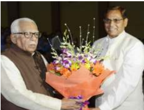
Shri Ram Naik Hon'ble Governor of Uttar Pradesh