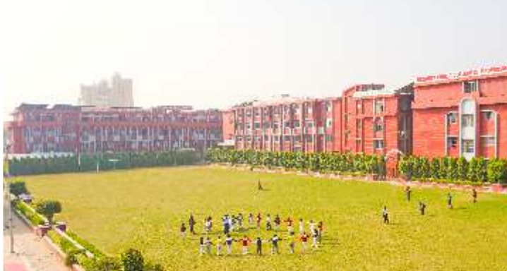
LUCKNOW PUBLIC COLLEGE, VINAMRA KHAND, (Hostel Facility) GOMTI NAGAR, LUCKNOW (Ph. 8188034421, 9044034412)

This branch is a "Dream Project" of LPS family. The branch is striving hard in its pursuit of all-round excellence by providing top quality education to students. This branch runs classes from Play Group to XII standard. Science, Commerce and Humanities subjects are offered in Senior Section. The branch has a huge auditorium, a swimming pool, a big play ground and facilities for all the games & sports, available here. The branch is well equipped with modern science laboratories and Computer lab. This branch also offers Hostel Facilities for boys and girls separately.