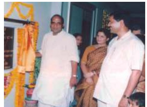
Shri Rajnath Singh, Hon'ble Home Minister, Govt. of India