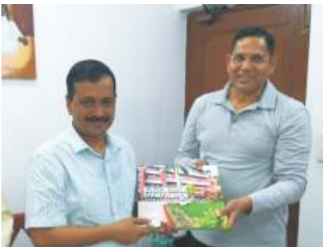
Shri Arvind Kejriwal, Hon'ble Chief Minister of Delhi