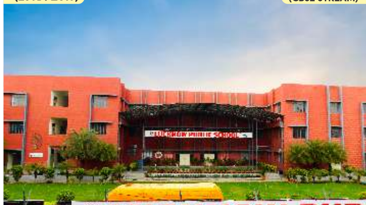
LUCKNOW PUBLIC SCHOOL, ASTHAL MANDIR MARG, SANGAM VIHAR, NEW DELHI (Ph. 8448281775/ 8448281776)

Beyond the state, into the capital of the country, Lucknow Public Schools & Colleges has made its ingress with this branch at Sangam Vihar, New Delhi, imparting quality education in the mega city. This branch, with its promising teaching assures to make its place among the classic centres of education in the metropolis soon. It focuses on discipline, academic excellence, positive sportsman spirit and leadership through co-curricular activities & good communication skills.