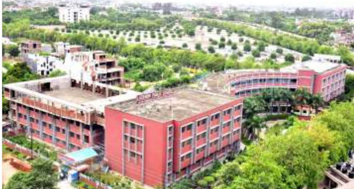
LUCKNOW PUBLIC SCHOOL, VRINDAVAN YOJNA, SEC-9, RAEBARELI ROAD, LUCKNOW (Ph. 9044069616, 8881969883)

This branch is affiliated to CBSE. The majestic building holds classes from Play Group to XII offering options in Science, Commerce and Humanities. The branch boasts of its sprawling play field, modern Computer labs, a richly furnished library, an Activity Hall for tiny tots, Kid's Gym Park, a big Swimming Pool and a magnificent indoor auditorium. The branch aims at imparting LPS culture along with enriching education to the suburbs of Lucknow. To ensure a holistic development of the child, it is well equipped with projectors and smart boards. The whole campus is well guarded and monitored with CCTV cameras.