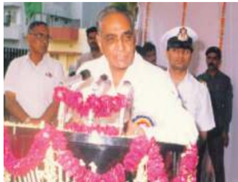
Shri Moti Lal Vora, Hon'ble Governor, UP, speaks