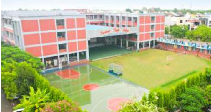
LUCKNOW PUBLIC COLLEGE, SAHARA STATES, JANKIPURAM, LUCKNOW (Ph. 9044031758, 0522-2735441)