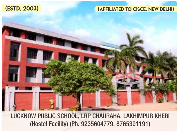
LUCKNOW PUBLIC SCHOOL, LRP CHAURAHA, LAKHIMPUR KHERI (Hostel Facility) (Ph. 9235604779, 8765391191)