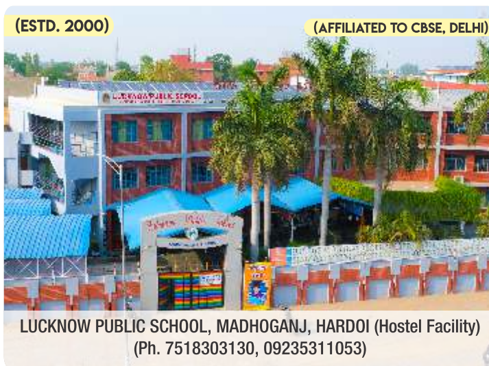
LUCKNOW PUBLIC SCHOOL, MADHOGANJ, HARDOI (Hostel Facility) (Ph. 7518303130, 09235311053)