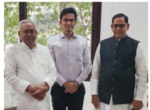
Shri. Nitish Kumar, Hon'ble Chief Minister of Bihar