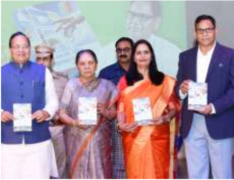
'Sapne Aur Rojgar Ki Rahen' book inaugurated by Smt. Anandiben Patel Hon'ble Governor of Uttar Pradesh