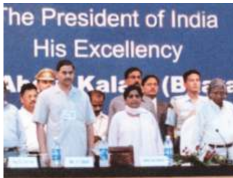
Ms. Mayawati, Hon'ble Chief Minister of UP