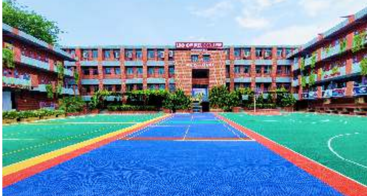
LUCKNOW PUBLIC COLLEGE, A-BLOCK, RAJAJIPURAM, LUCKNOW (Ph. 0522-4231052, 8188037816)