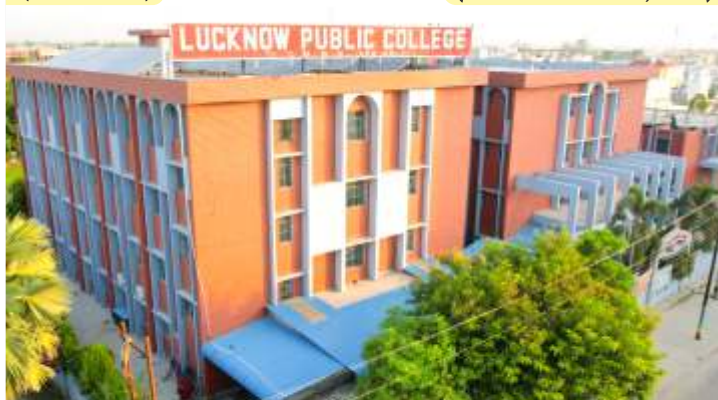
LUCKNOW PUBLIC COLLEGE, SEC.-E, AMRAPALI YOJNA, HARDOI ROAD, LUCKNOW (Ph. 9044061201)

This branch is another sincere endeavour of Lucknow Public Schools and Colleges to spread quality education to the far flung areas of Lucknow. This branch is well equipped with Hi-tech Science & Computer labs, Swimming pool, Auditorium, a lush green and huge play ground, badminton and basketball courts, latest teaching aids, a rich library and well ventilated class rooms. It has Classes running from Play Group to XII offering Science & Commerce streams.