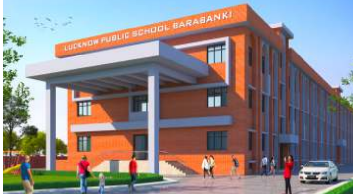
LUCKNOW PUBLIC SCHOOL, ASENI MOD, BARABANKI (Ph. 7068885086)

This Branch will be affiliated to CBSE. This Branch too aims like its counterparts in inculcating among its students high sense of respect for humanity, moral values, patriotism along with an excellent standard of education which is the trademark of LPS. This Branch is well equipped with spacious classrooms, a huge Astroturf (synthetic) Playground befitting for all kinds of sports, Open Gym, Activity Room, an Auditorium (Proposed), a Swimming Pool as well as Hi-Tech Computer and Science Labs along with Smart Classes for making its students versatile in all spheres of education.