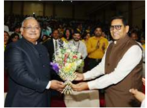
Hon'ble Mr. Justice Dinesh Maheshwari Former Judge Supreme Court of India