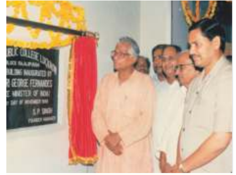
Shri George Fernandes Hon'ble Defence Minister of India