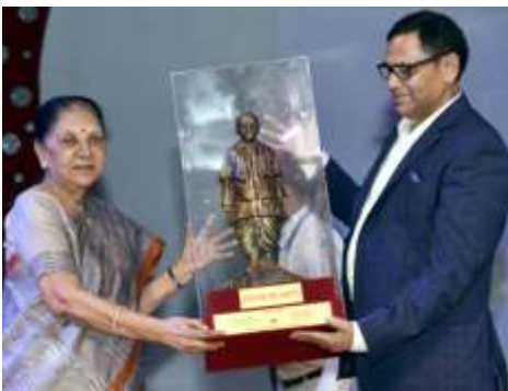
Smt. Anandiben Patel Hon'ble Governor of Uttar Pradesh