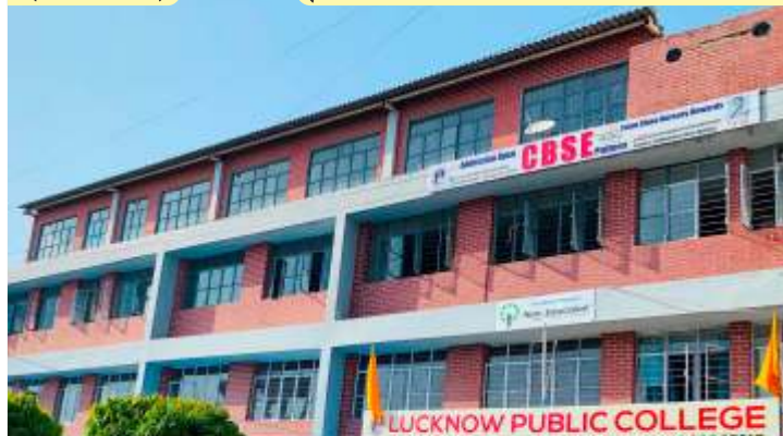
LUCKNOW PUBLIC COLLEGE, B-BLOCK, RAJAJIPURAM, LUCKNOW (Ph. 8090037815)

(AFFILIATED TO UP BOARD WITH CBSE PATTERN)