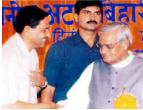
Shri Atal Bihari Vajpayee Hon'ble Prime Minister of India