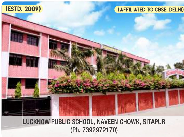
LUCKNOW PUBLIC SCHOOL, NAVEEN CHOWK, SITAPUR (Ph. 7392972170)

This branch has been working day and night to provide 'Quality Education to All' since its inception in 2009. This is affiliated to CBSE with streams of science, commerce and humanities and holds classes from Play Group to XII. It is well equipped to impart knowledge and skills towards the all round development of the children residing in areas where education is limited. Facilities like Hi-tech computer labs, well equipped Physics, Chemistry, Biology, Geography, Psychology Labs and Atal Tinkering Lab, well ventilated Class Rooms, Activity Room, Auditorium, Open Gym, separate Swimming Pools for Pre-Primary and senior students, and a huge Play Ground along with a synthetic ground, have been provided to bring the students at par with their counterparts in the capital city.