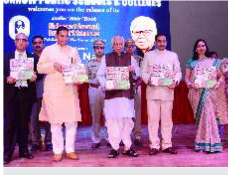
CTB of Lucknow Public Schools & Colleges inaugurated by Shri Ram Naik Hon'ble Governor of Uttar Pradesh